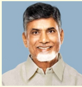
Shri N. Chandra Babu Naidu, Hon'ble Chief Minister of Andhra Pradesh