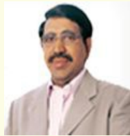
Dr. P Narayana, Hon'ble Minister of MA&UD, AP