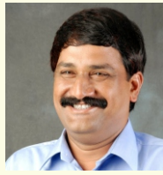
Shri. Ganta Srinivasa Rao, Hon'ble Minister of HRD, AP