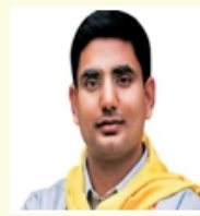
Shri N Lokesh, Hon'ble Minister of Panchayat Raj, & ITC, AP