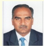
Shri BSS Prasad, IFS, Chairman, APPCB, Govt. of AP